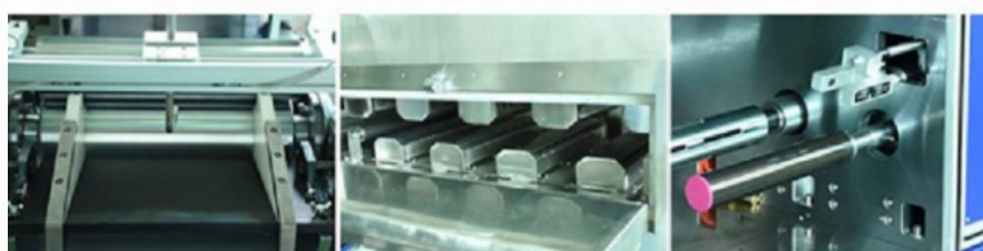
Slurry dam board and stirring paddle