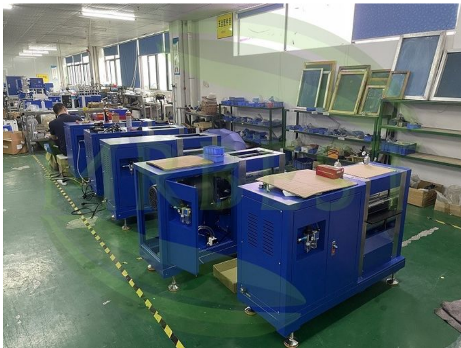
Optionla Pressure Controlled Rolling Press Machine with Winding and Unwinding Device