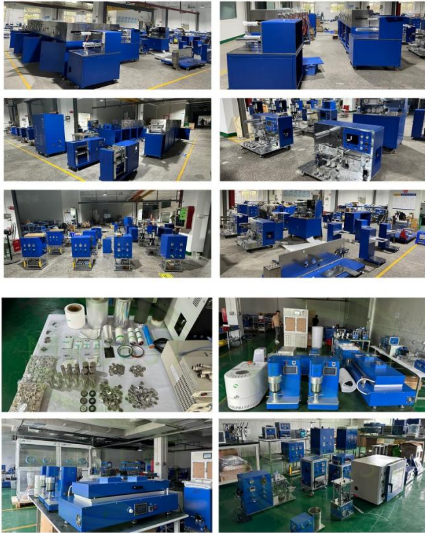
Shenzhen Meirui Zhida Technology Co., Ltd

Manufacturer Vendor for Lithium Battery Equipment in Shenzhen China MRBEST Engineers has over 20 years experience in Lithium-ion Battery Researching and Manufacturing! MRBEST International Sales Team has over 10 years export experience 24*7 Online after-sale dept and quick response! Provide complete solution for Battery & Material Research Equipment MRBEST Factory with ISO Certificate and products are CE approved