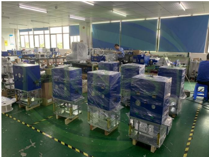
Pouch Cell Assembly Machines