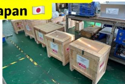
Pouch Cell Assembly Machines