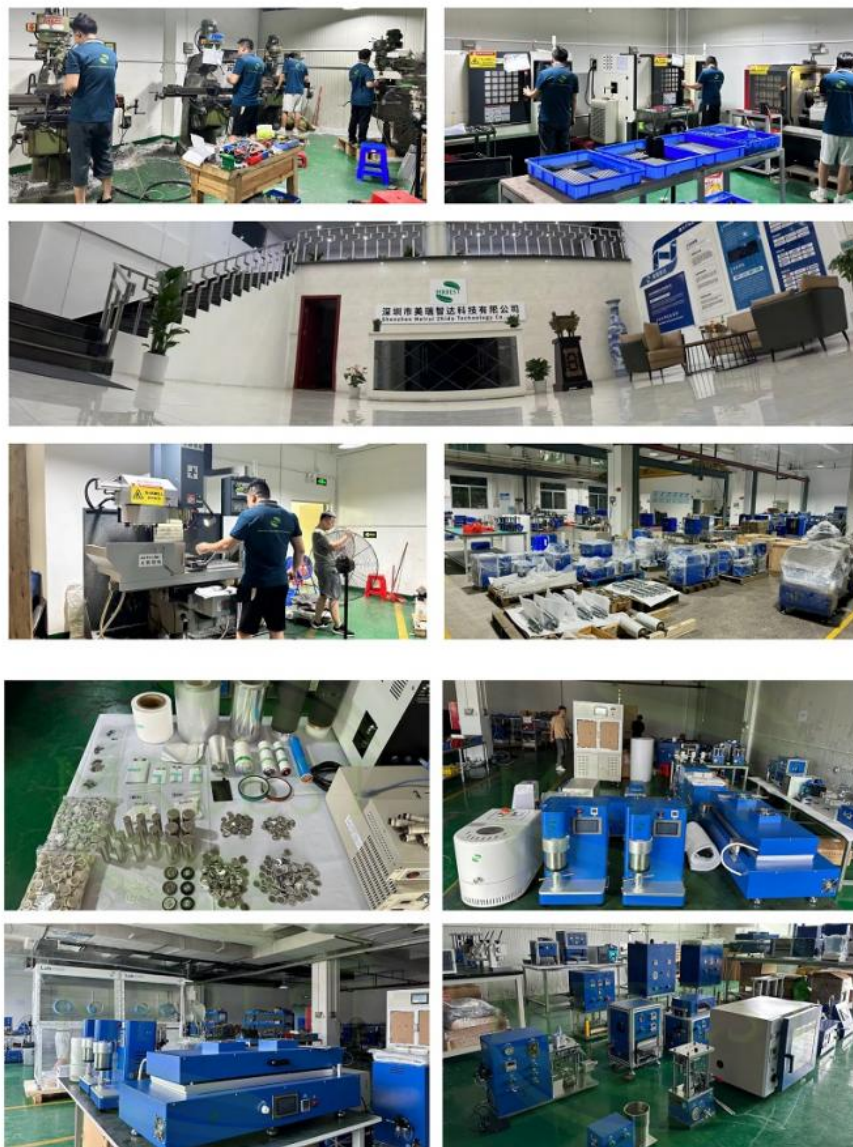
Shenzhen Meirui Zhida Technology Co., Ltd

Manufacturer Vendor for Lithium Battery Equipment in Shenzhen China MRBEST Engineers has over 20 years experience in Lithium-ion Battery Researching and Manufacturing!